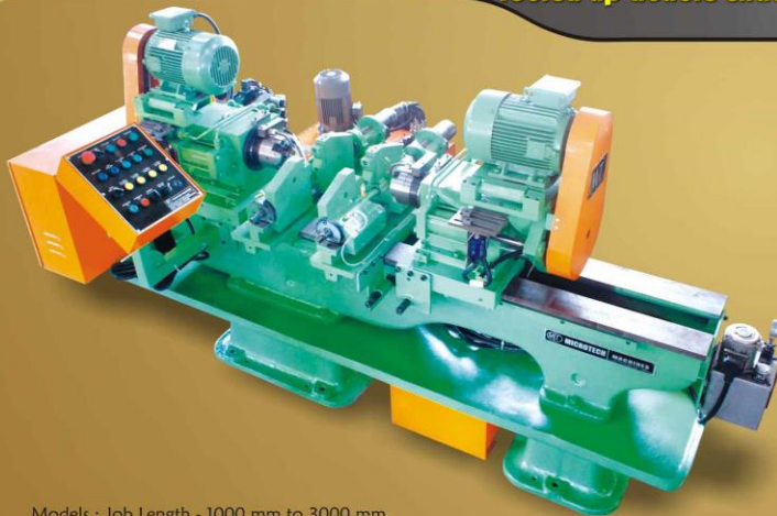
Models : Job Length - 1000 mm to 3000 mm.

Job Gripping Capacities Dia : 15 - 110 mm. Job Length Dia : 150 - 1000 mm. Facing Dia : 60 mm. Total Electric Power : 9.2 HP. Center Drill Size : A 2.5-A 6.3 / B 1.6-B 6. Quill Stroke Dia : 60 mm.